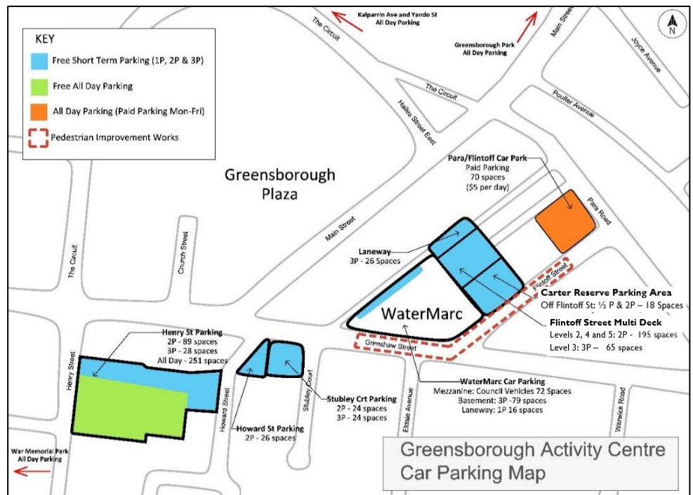
Figure 1 - Parking Around Greensborough Activity Centre

Disabled parking (6 spaces) are available on the top level (L5) of the multi-deck carpark. These have direct access to the ground level of the Council building. A further 4 disabled parking spaces are situated on level 3 of the multi-deck carpark and are accessible via Flintoff St.