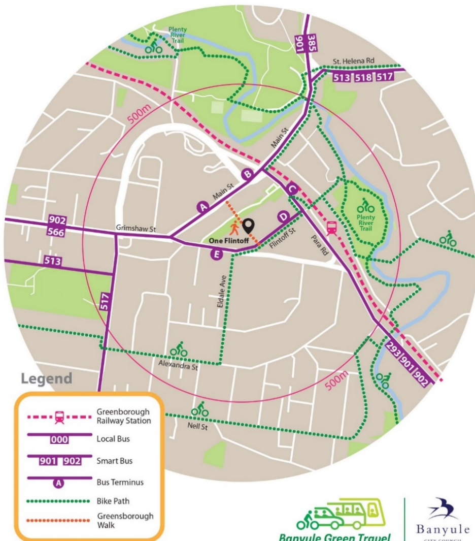
Figure 3: Public Transport, cycling and walking access

There are several marked cycling routes in place that lead directly to the office. There are many other unmarked routes that can be taken on the surrounding quiet local streets. The Plenty River Trail also provides an off road cycling route.